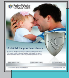
Quarter Page 3.57" X 5.0"