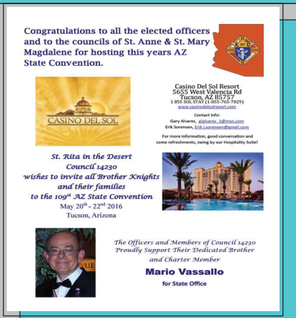
Full Page 7.75" X 10.25